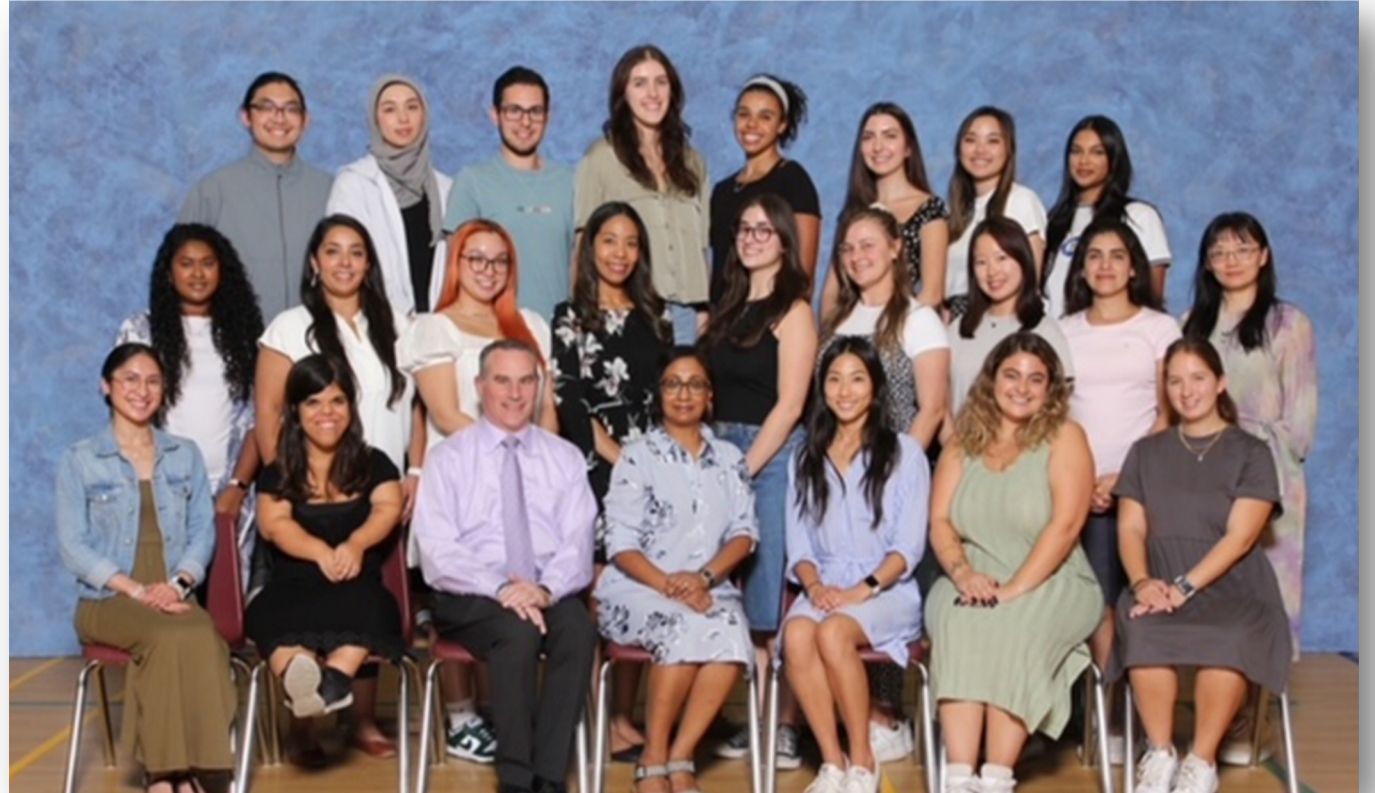
2023-24 OISE MT/YRDSB Carnegie Cohort 181