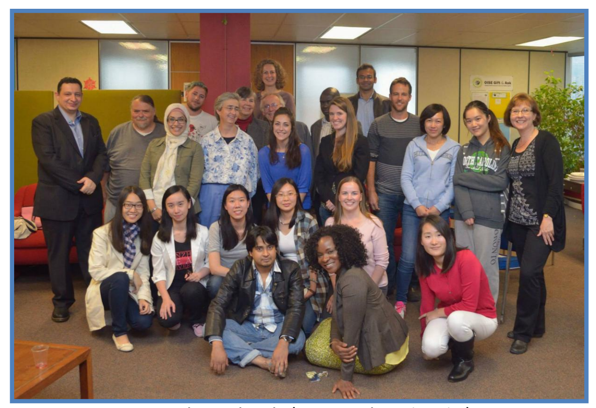
CIDEC Students and Faculty (2014-15 Student Orientation)