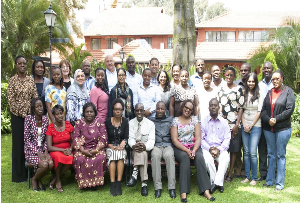
Science of Early Child Development (SECD) SHORT COURSE Aga Khan University Institute for Human Development (IHD)

An Initiative of the Aga Khan Development Network (AKDN) in partnership with the Conrad N. Hilton Foundation Mon April 7th - Sat 12th, 2014, Venue: Fairmont The Norfolk Hotel Nairobi, Kenya