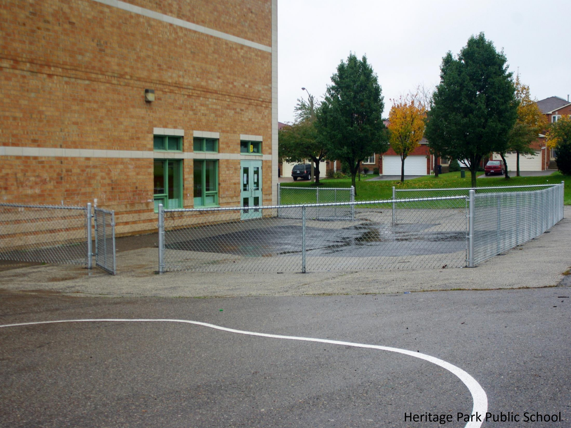
Heritage Park Public School