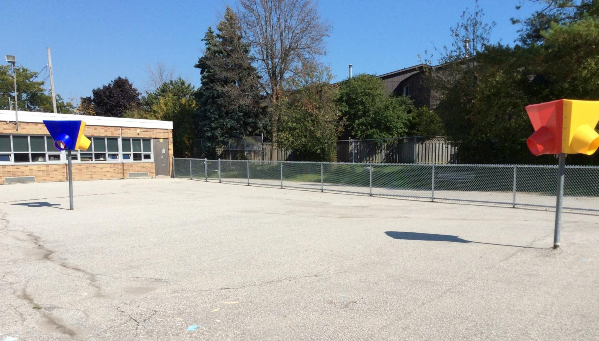
HA Halbert Junior Public School