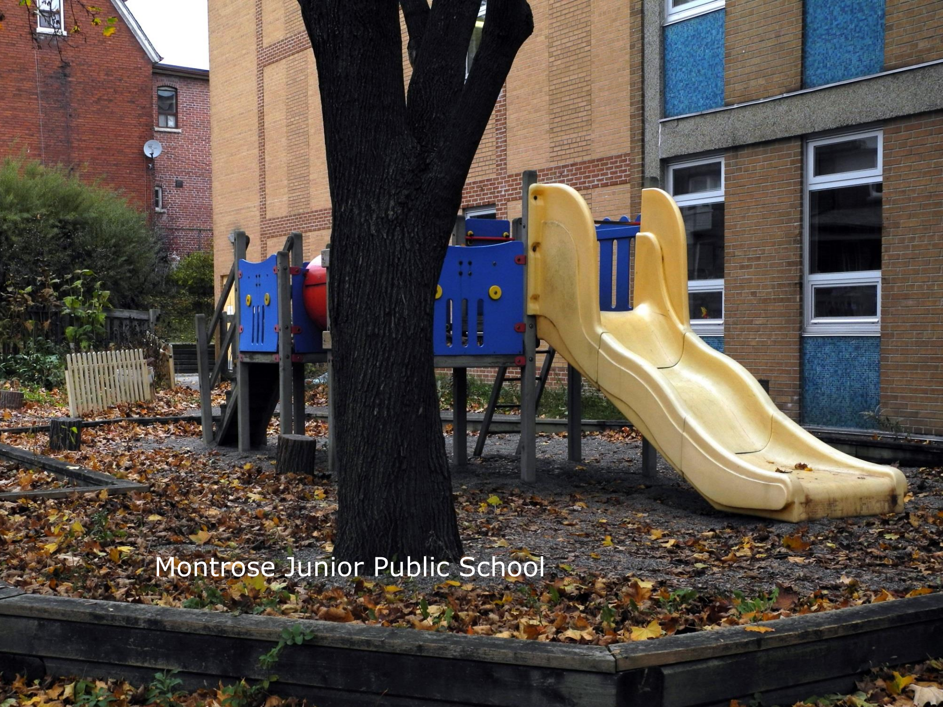
Montrose Junior Public School