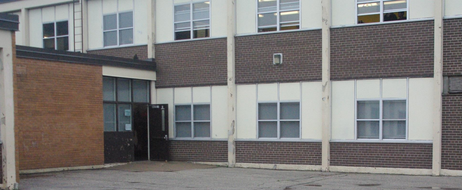
North Bendale Junior Public School